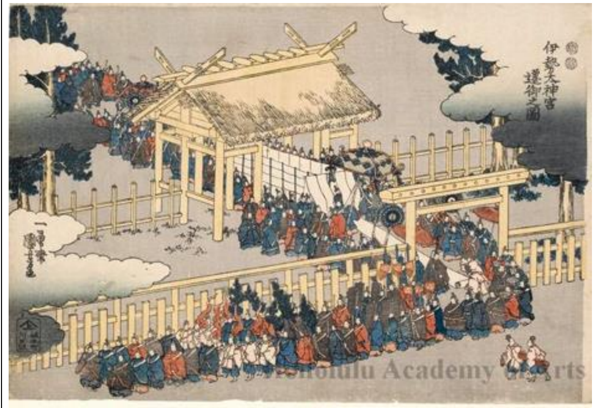
"Honolulu Academy of Arts» The Transfer Ceremony at Ise Shrine." Honolulu Academy of Arts . Honolulu Museum of Art, n.d. Web. 7 Aug. 2012. <a href="http://honolulumuseum.org/art/10404-the-transfer-ceremony-at-ise-shrinear">http://honolulumuseum.org/art/10404-the-transfer-ceremony-at-ise-shrinear</a>.

Source: "The Transfer Ceremony at the Ise Shrine" (1847 – 1852) is a Woodblock print by artist Utagawa Kuniyoshi. Ise Grand Shrine dedicated to goddess Amaterasu-ōmikami, a Shinto goddess of the sun and universe. The Emperor of Japan is believed to be a direct descendent of Amaterasu.