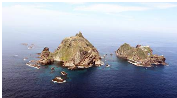
An aerial view of Dokdo islets in this file photo taken on July 5