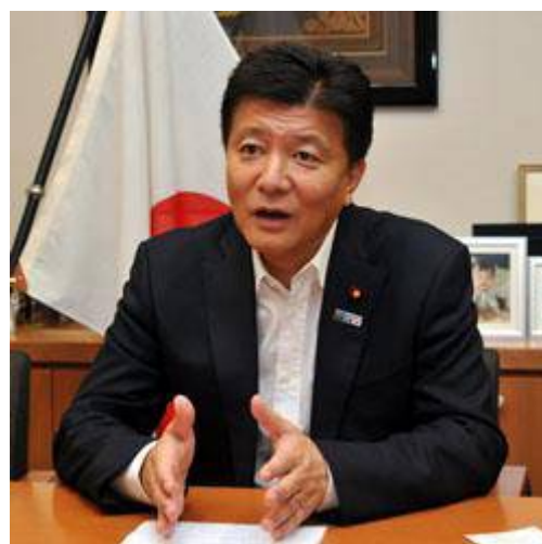
Disappointed: Liberal Democratic Party lawmaker Yoshitaka Shindo is interviewed Wednesday in Tokyo.

Shindo claimed the lawmakers intended only to get South Korea's perspective on the disputed islets and observe what kind of research was being carried out there. "The problem of the Takeshima issue is that there's no opportunity (for the two countries) to discuss and understand differences of claims from each side."