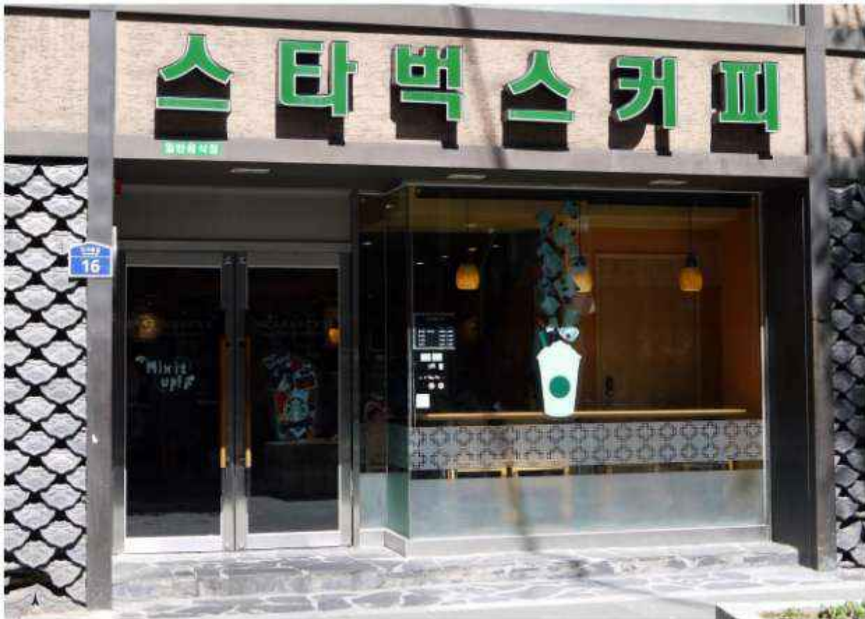
A Starbucks in Hangill