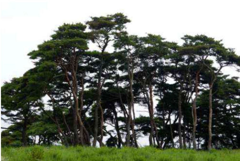
Trees at an archeological site in the southern part of the Korean Peninsula