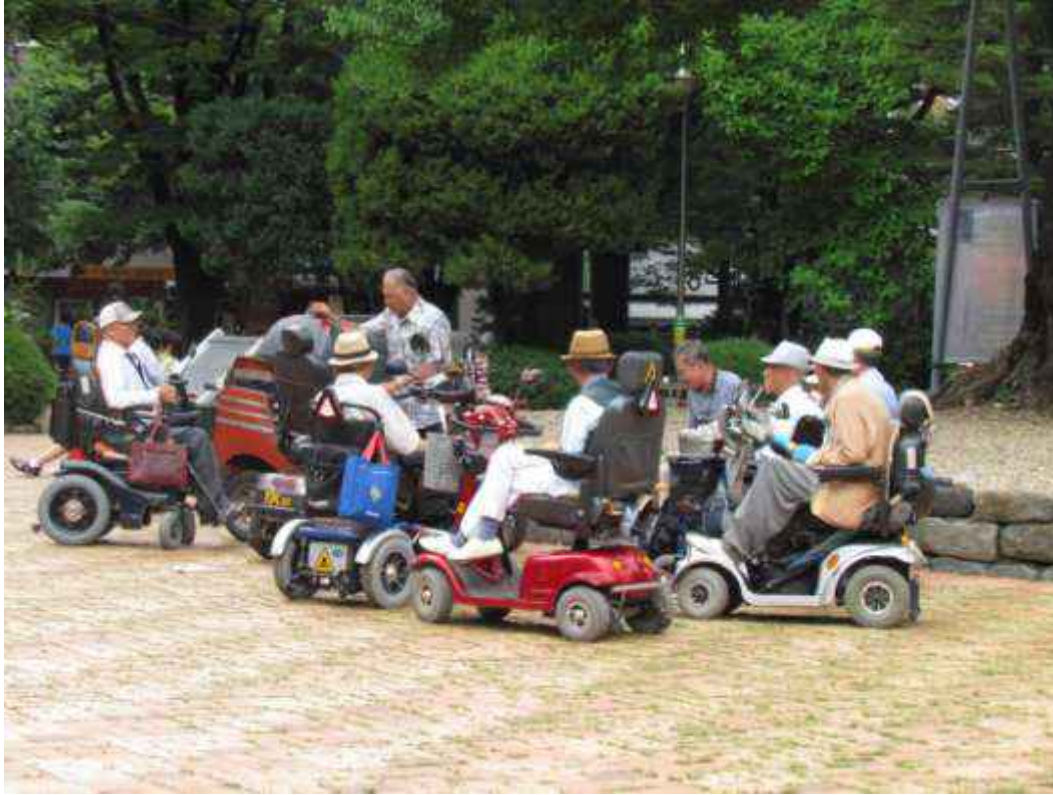
A gathering of elderly men at a park in the southern part of the Korean Peninsula