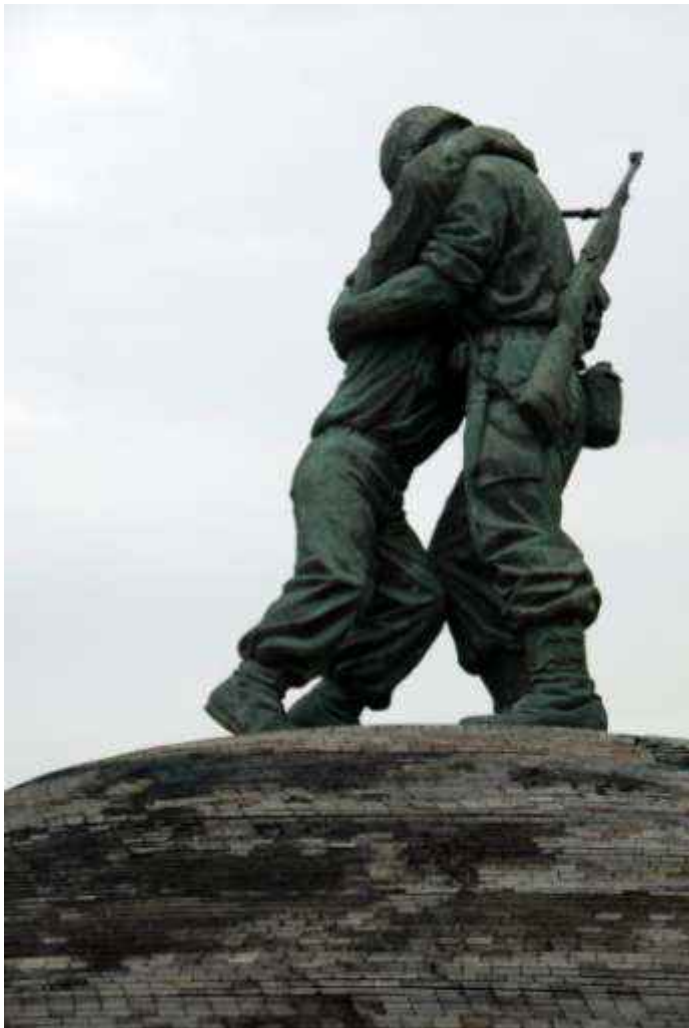
A statue in Seoul, South Korea, to symbolize a reunified Korean Peninsula