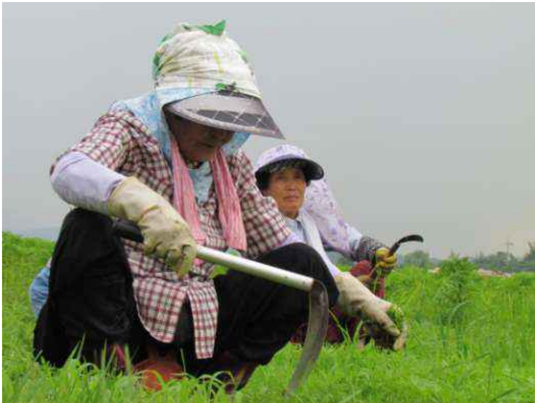
Korean women working in the field of the South Korean countryside