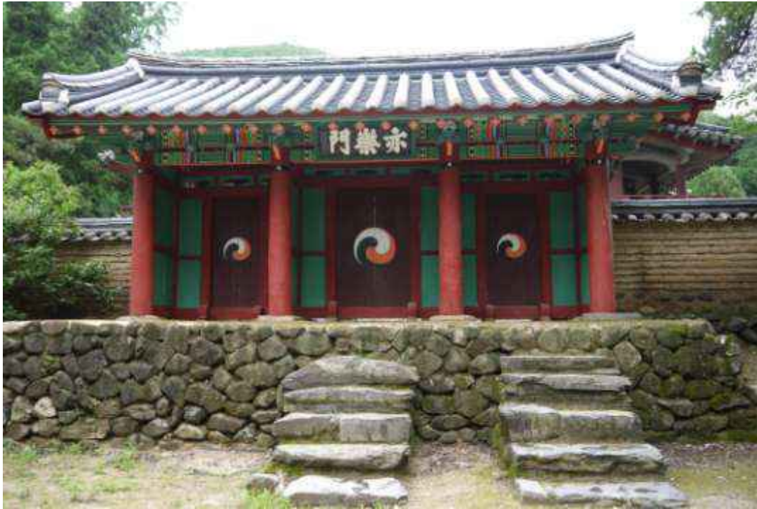
A Confucian school in the southern part of the Korean Peninsula