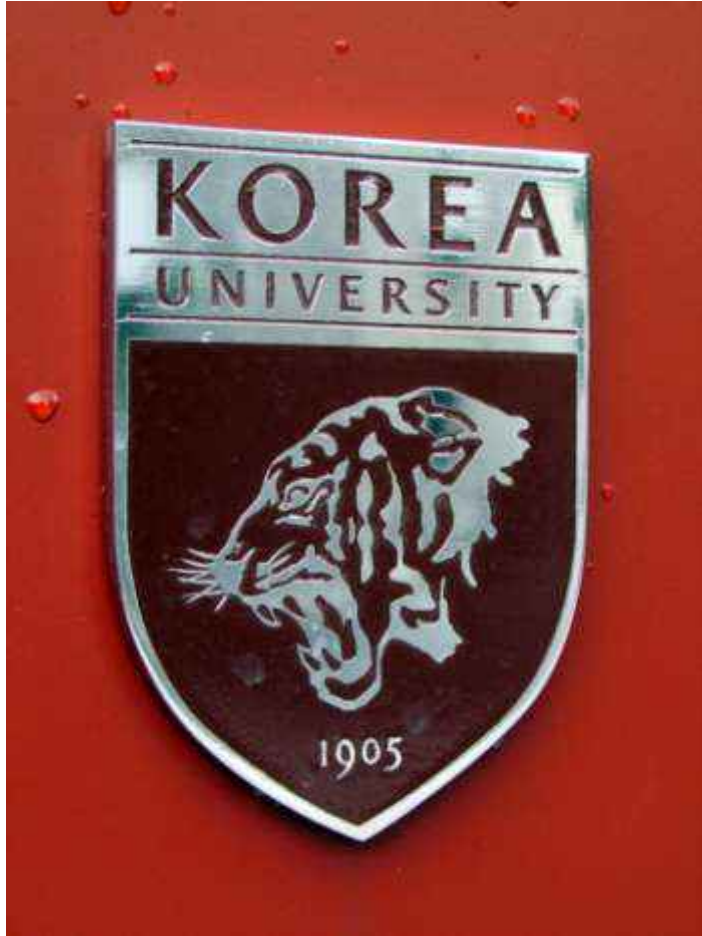
The emblem for Korea University in Seoul, South Korea