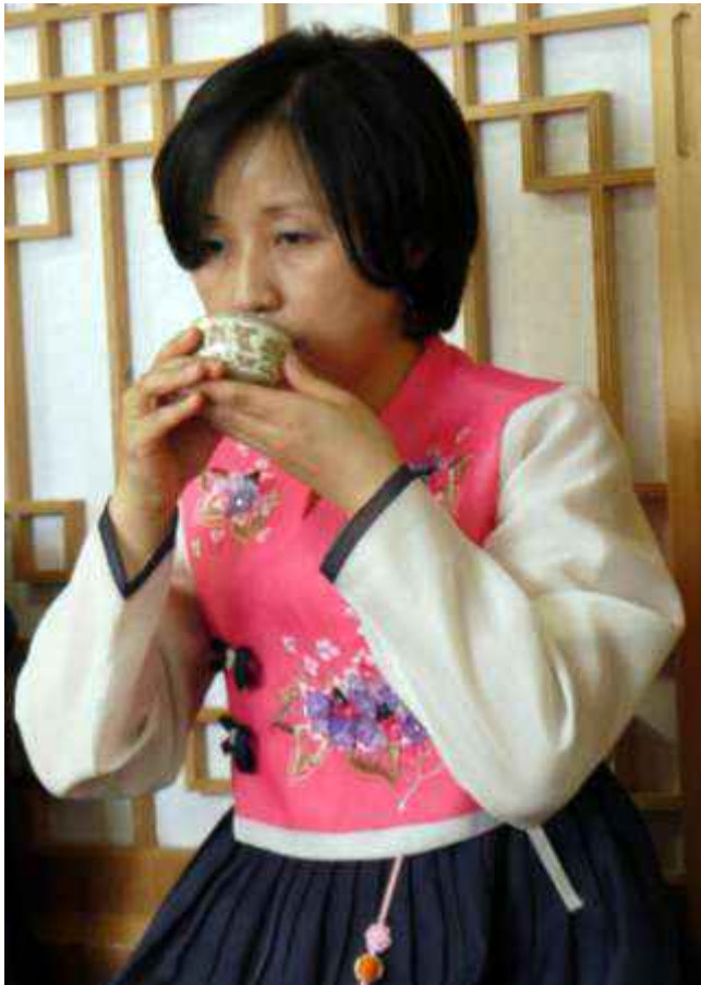
A Korean woman wearing the hanbok participates in a tea ceremony