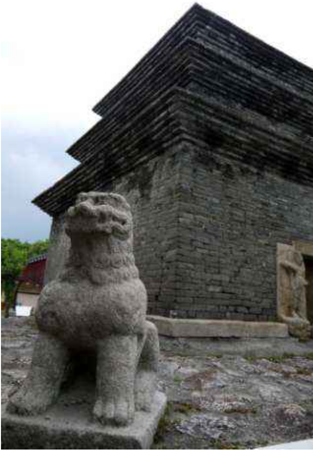
A stone pagoda in the southern part of the Korean Peninsula