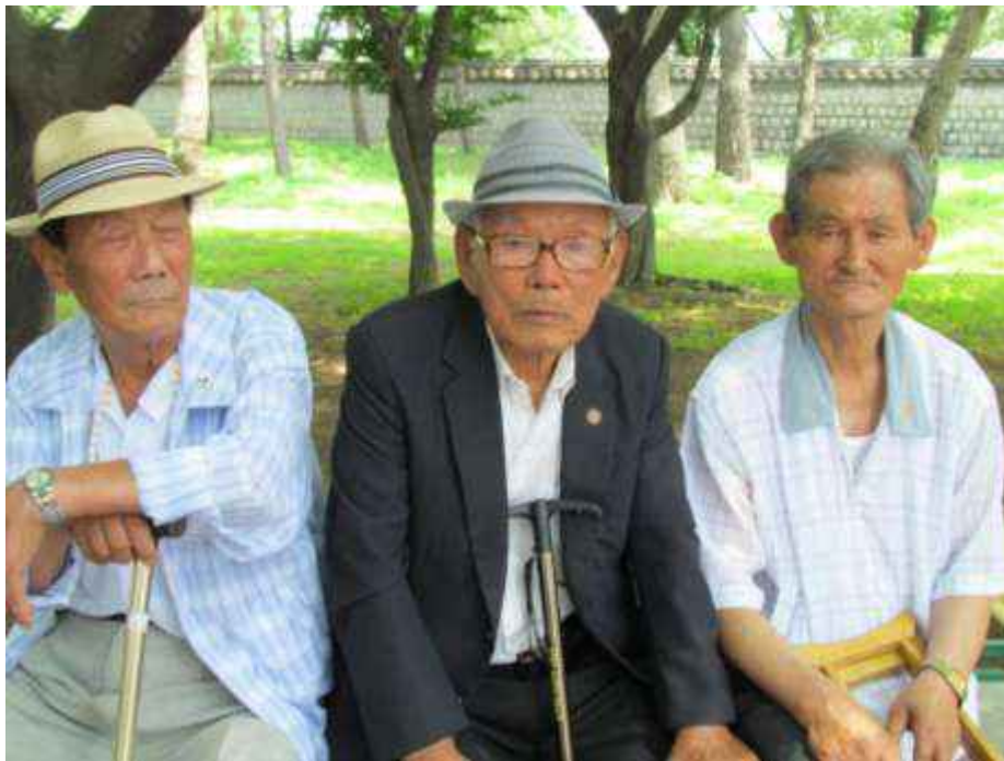
Three elderly men relaxing at a park in the southern part of the Korean Peninsula