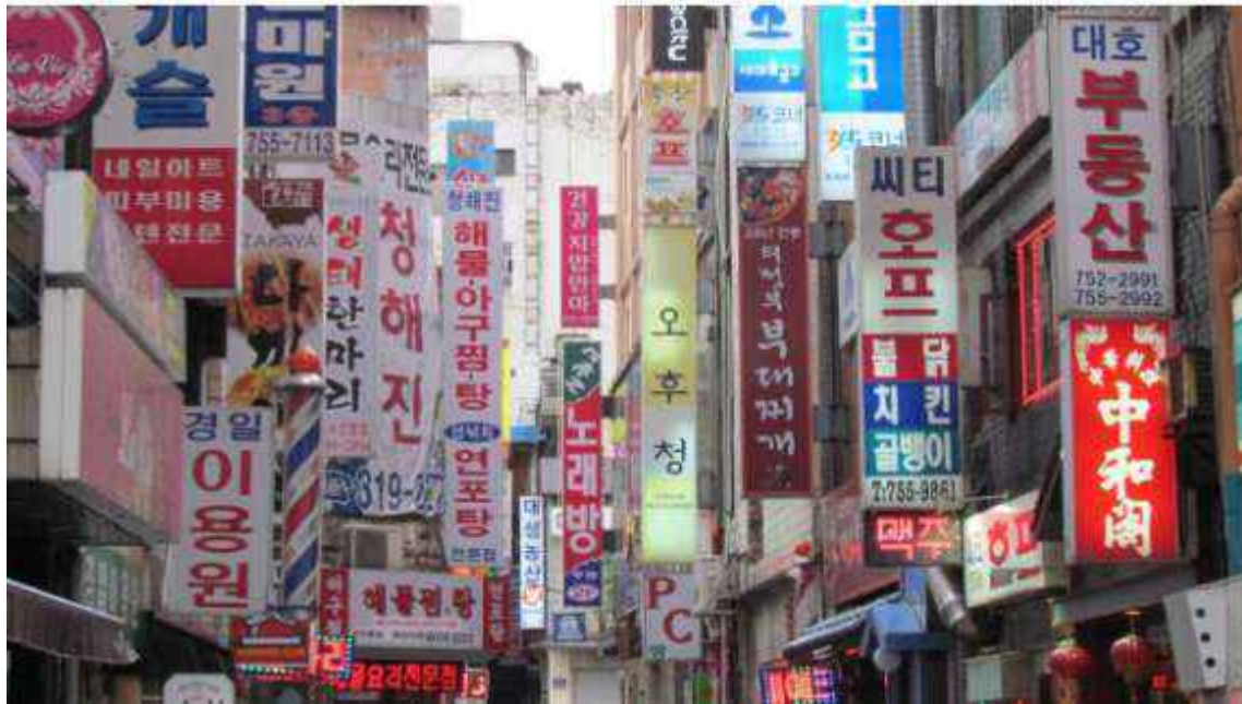
A street in Seoul, South Korea