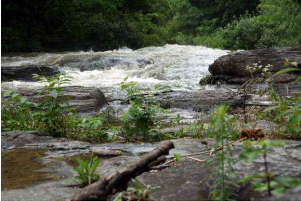
A stream in the South Korean countryside