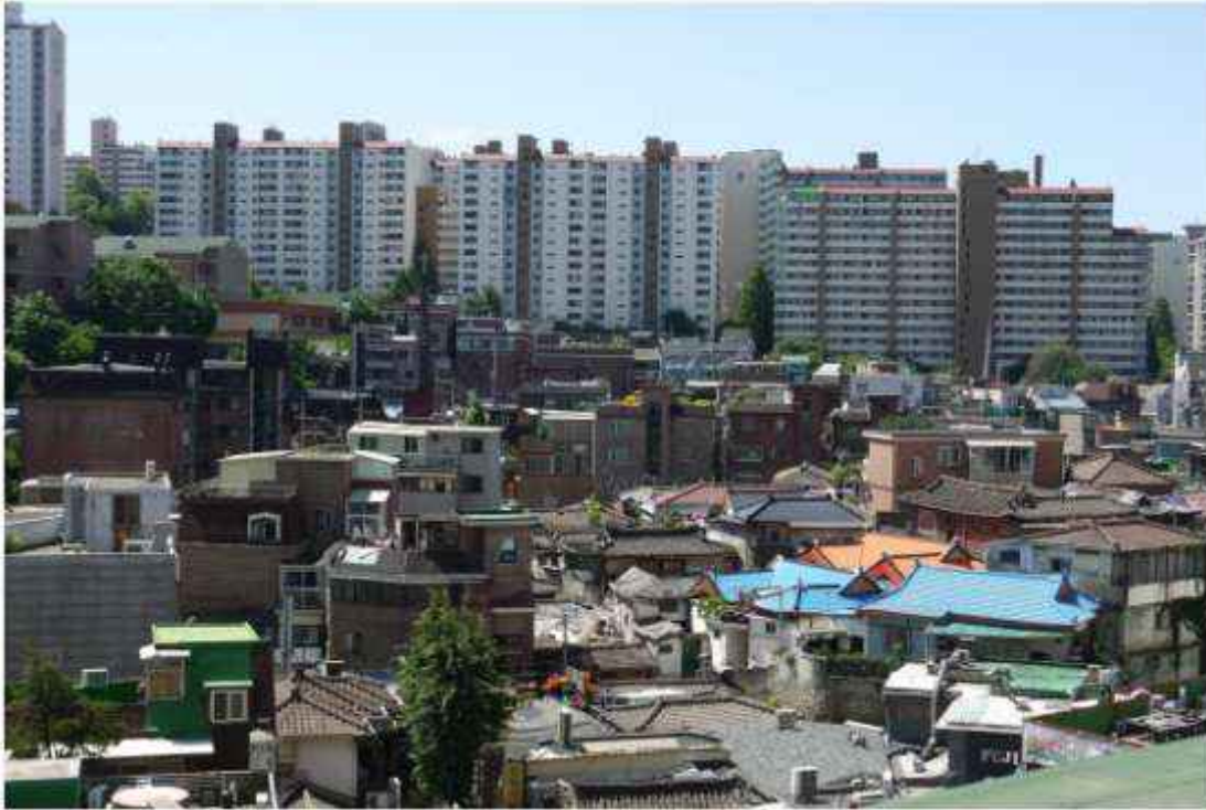
Buildings in modern Seoul South Korea