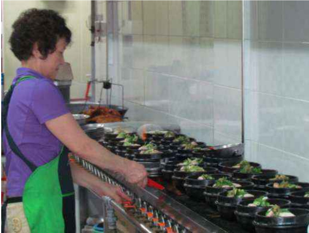
A Korean woman prepares ginseng chicken soup