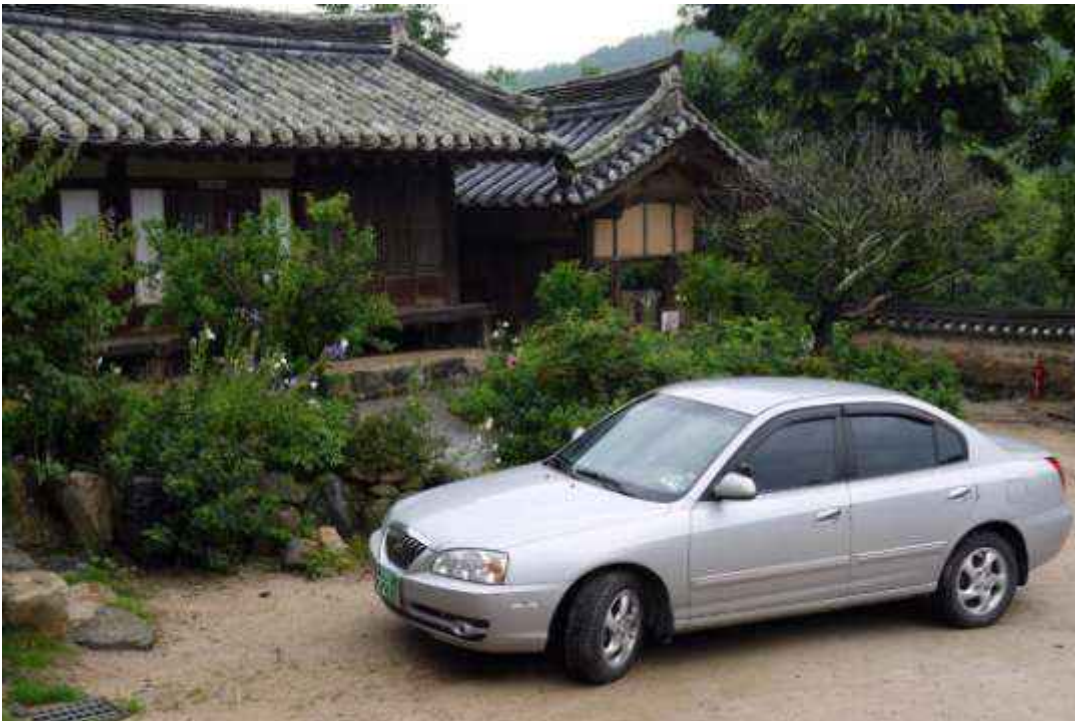
A home in a village in the southern part of the Korean Peninsula