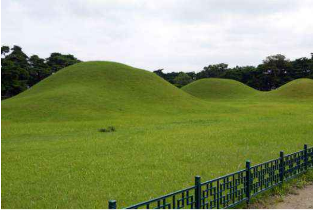
Ancient royal tombs in the southern part of the Korean Peninsula