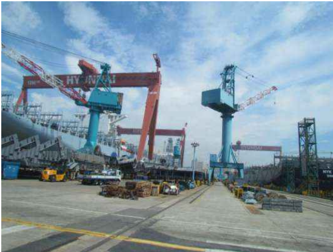
Hyundai Heavy Industries in South Korea