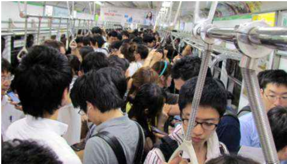
A crowded subway train in Seoul, South Korea