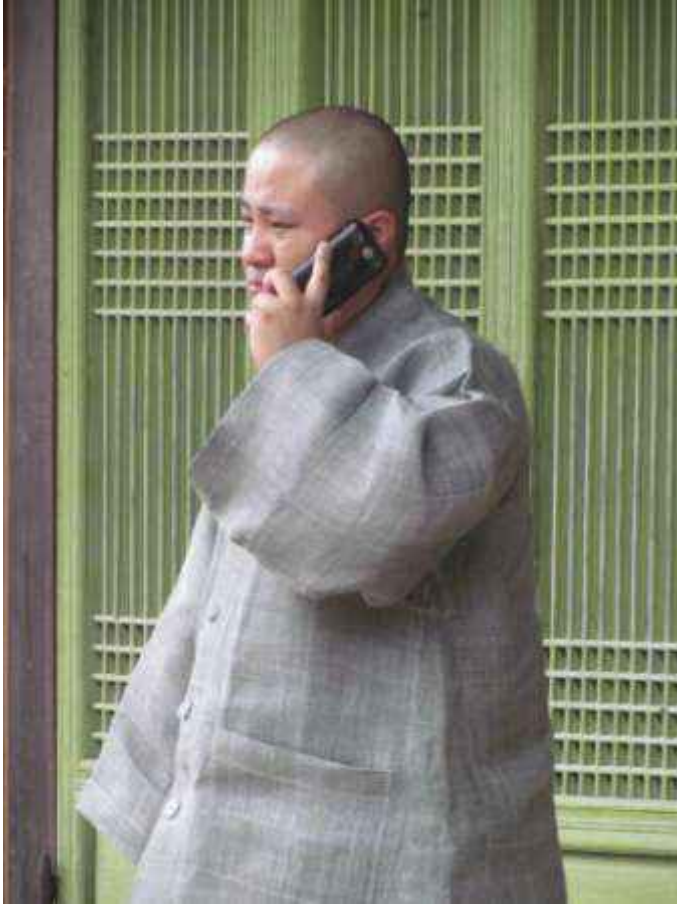
A monk talks on a cell phone at a Buddhist temple in the southern part of the Korean Peninsula