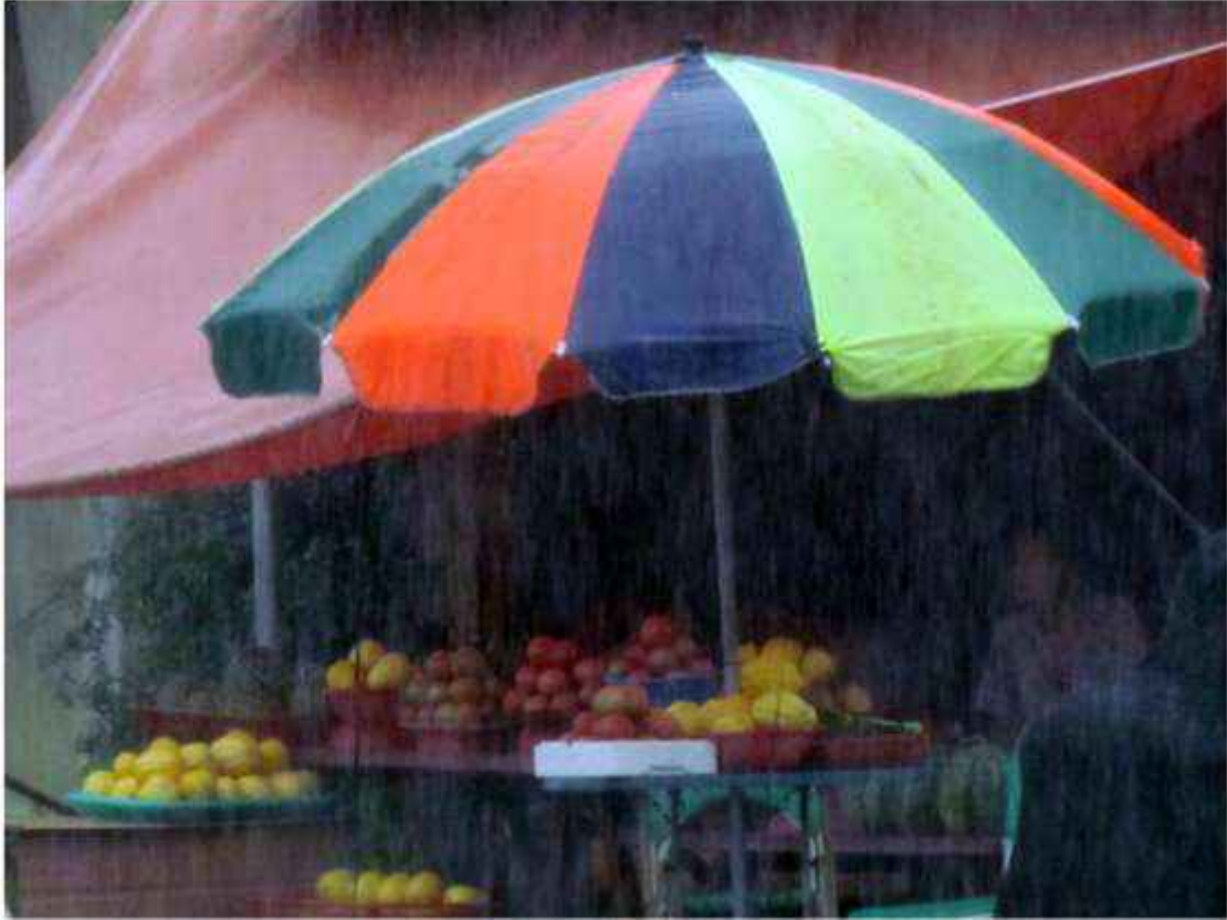
A produce vendor in the monsoon rains of a Korean summer