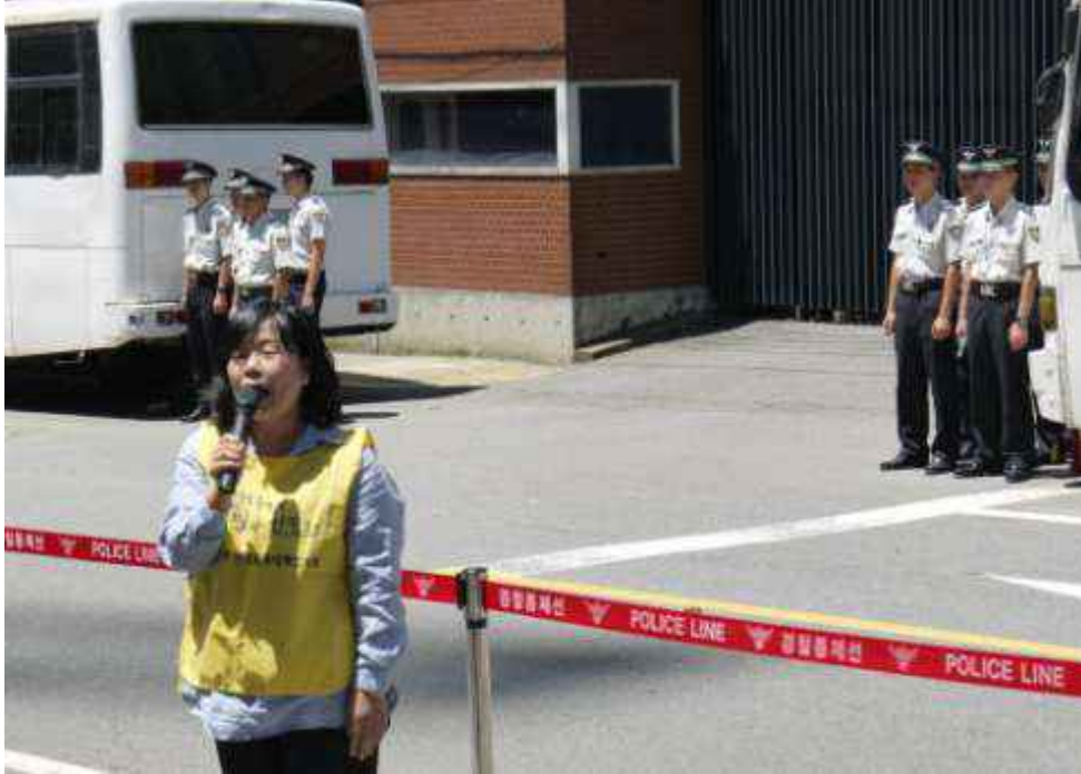
A Korean woman and police officers in front of the Japanese Embassy in Seoul, South Korea, to protest the Japanese treatment of Koreans during occupation