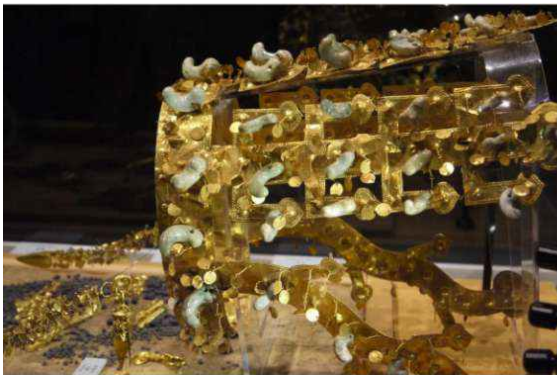
An ancient royal crown in Korea