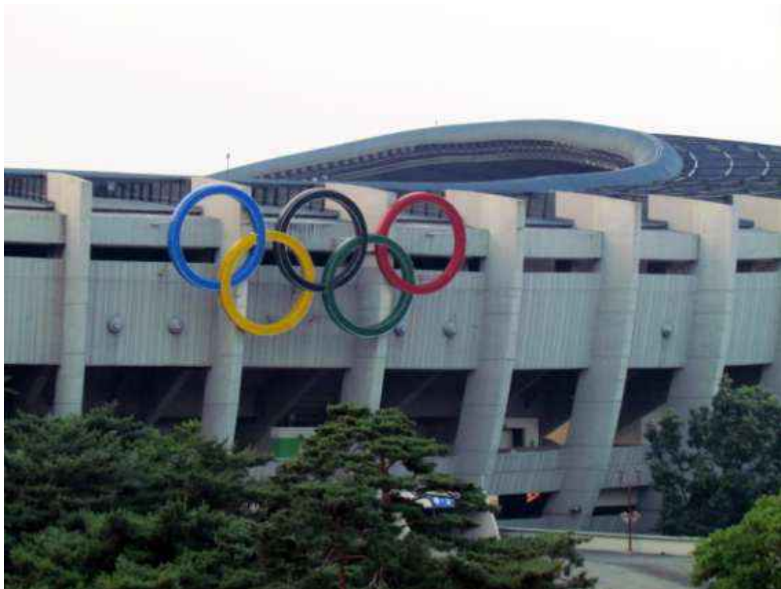
The Olympic Stadium in Seoul, South Korea