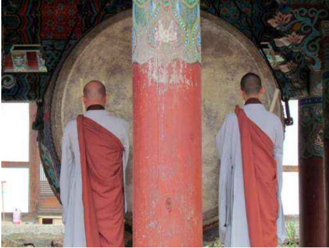
Two Buddhist monks play the drum at a temple