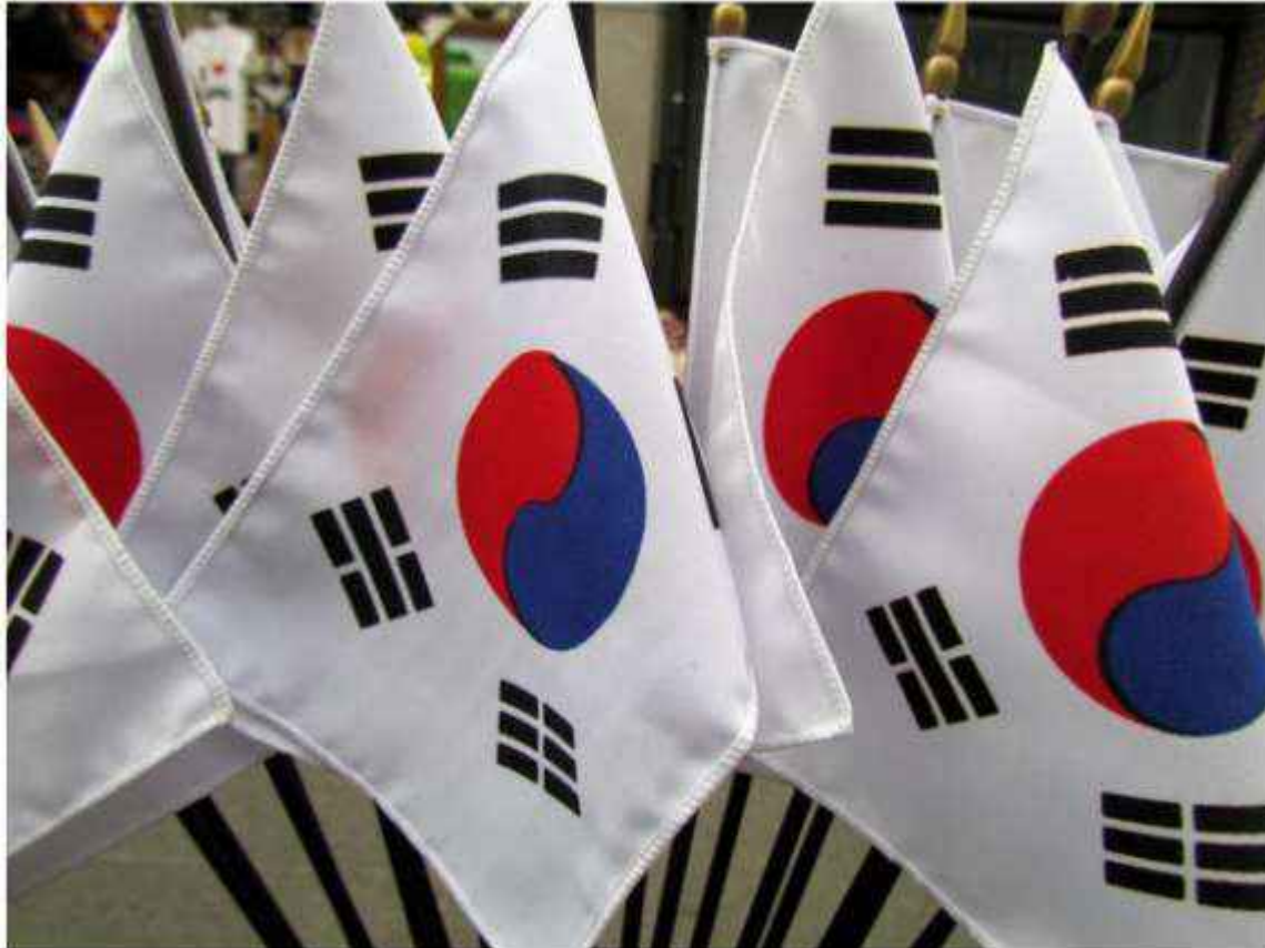
The flag of South Korea