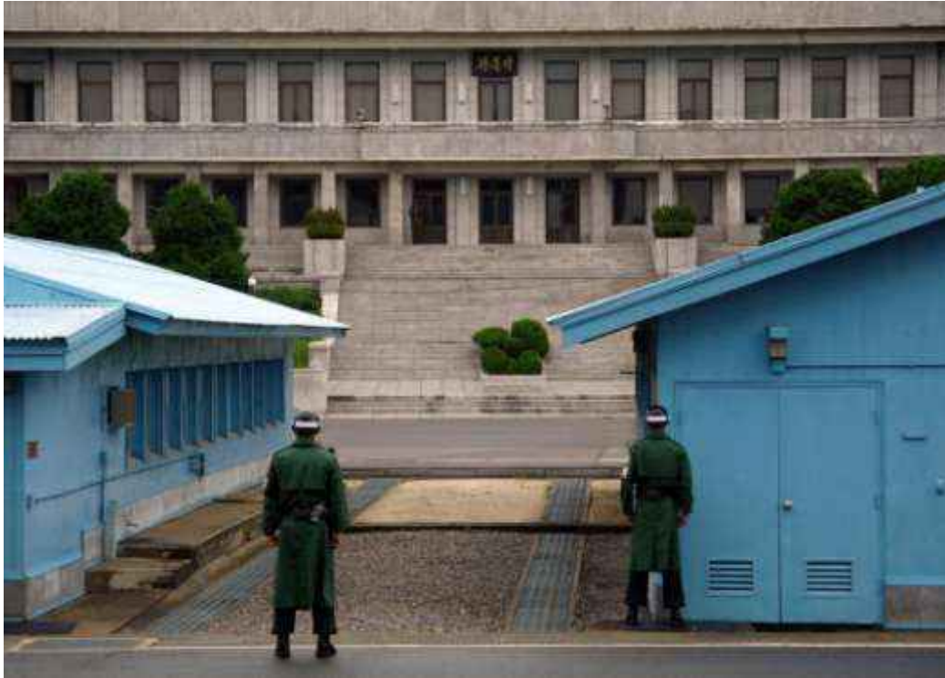
The border of North Korea and South Korea in the Demilitarized Zone