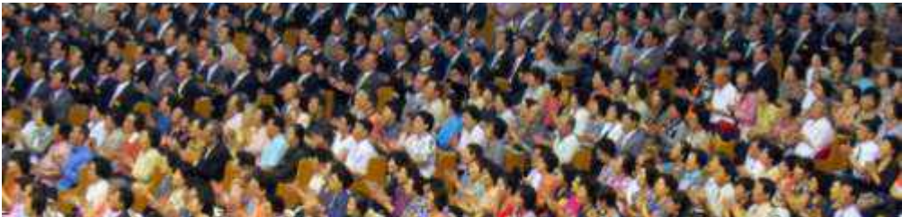
The congregation at the Yoido Full Gospel Church, the world's