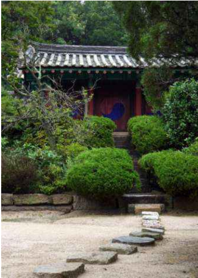
The yin and yang sign on a door in a Korean village