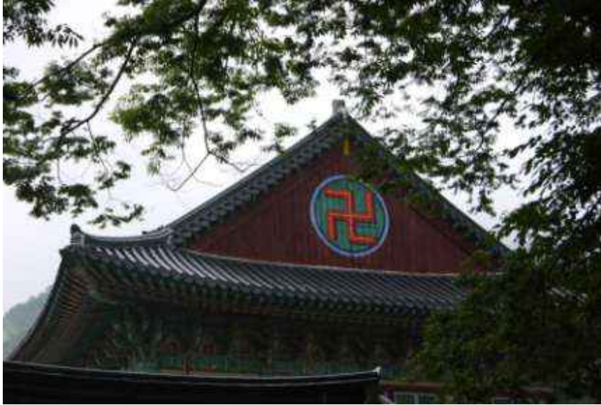
A swastika at the site of a Buddhist temple

Photograph to use during the delivery of the content: