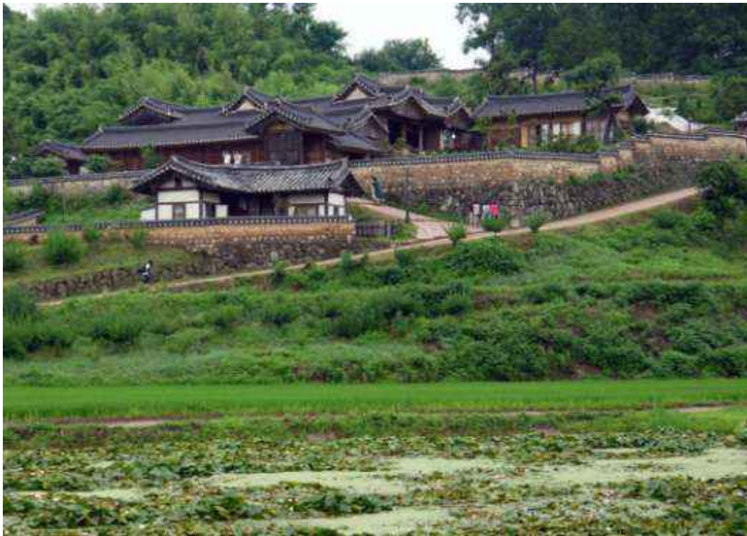
The village of Yang Dong in the southern part of the Korean Peninsula