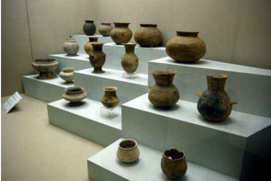
Ancient Korean pottery