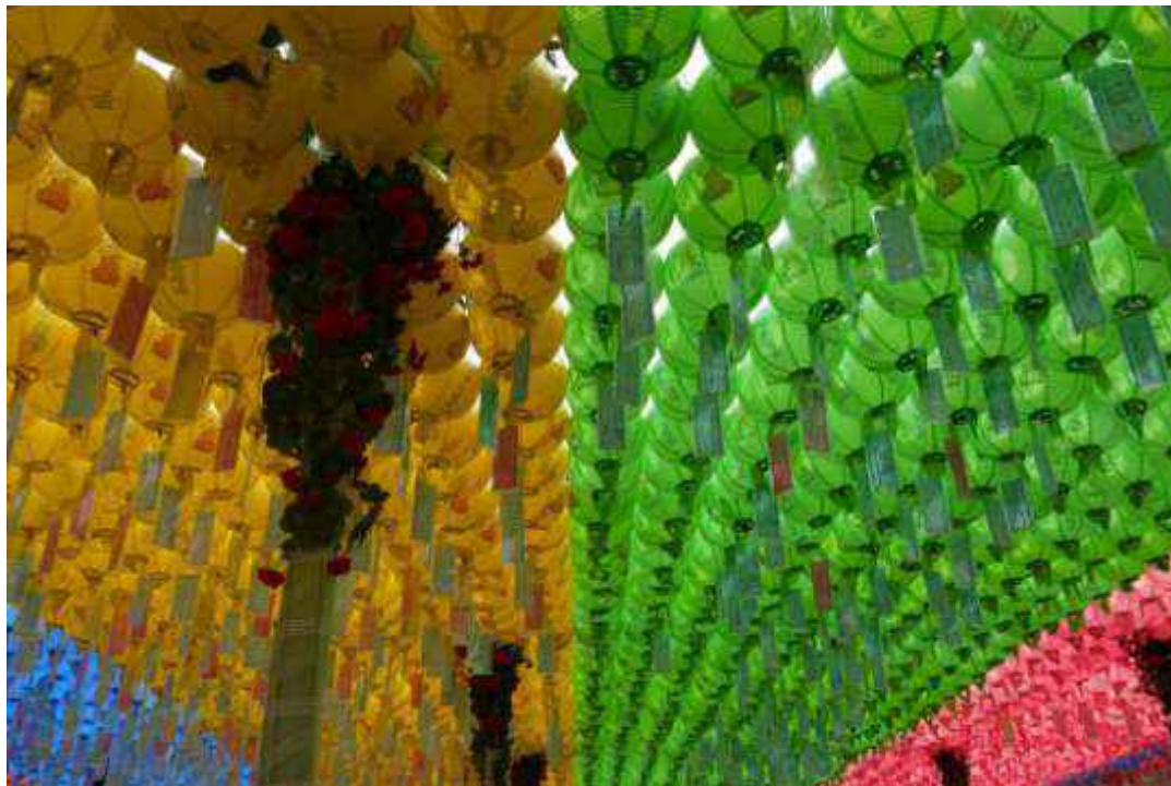
Numerous lanterns hanging at a Buddhist temple in the southern part of the Korean Peninsula