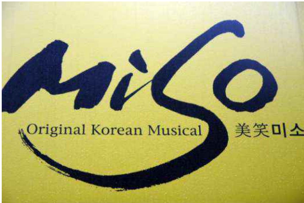
A sign advertising a Korean musical performance in Seoul, South Korea