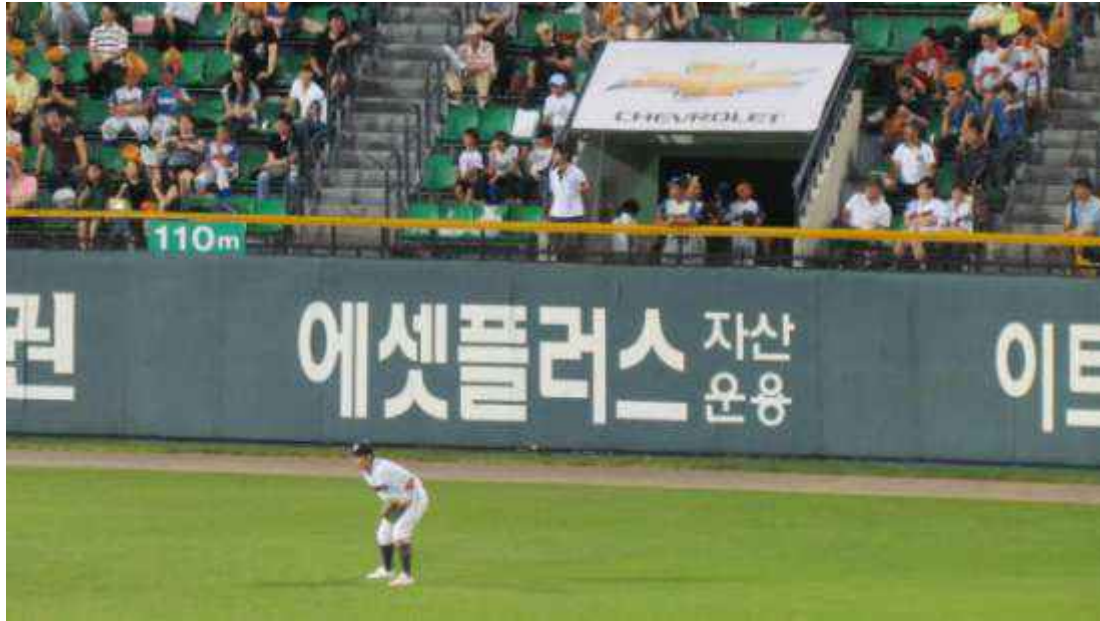
A professional baseball game in Seoul, South Korea