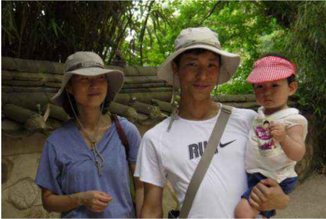
A Korean family