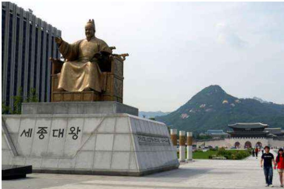
A statue of Sejong the Great, the creator of Hang'ul