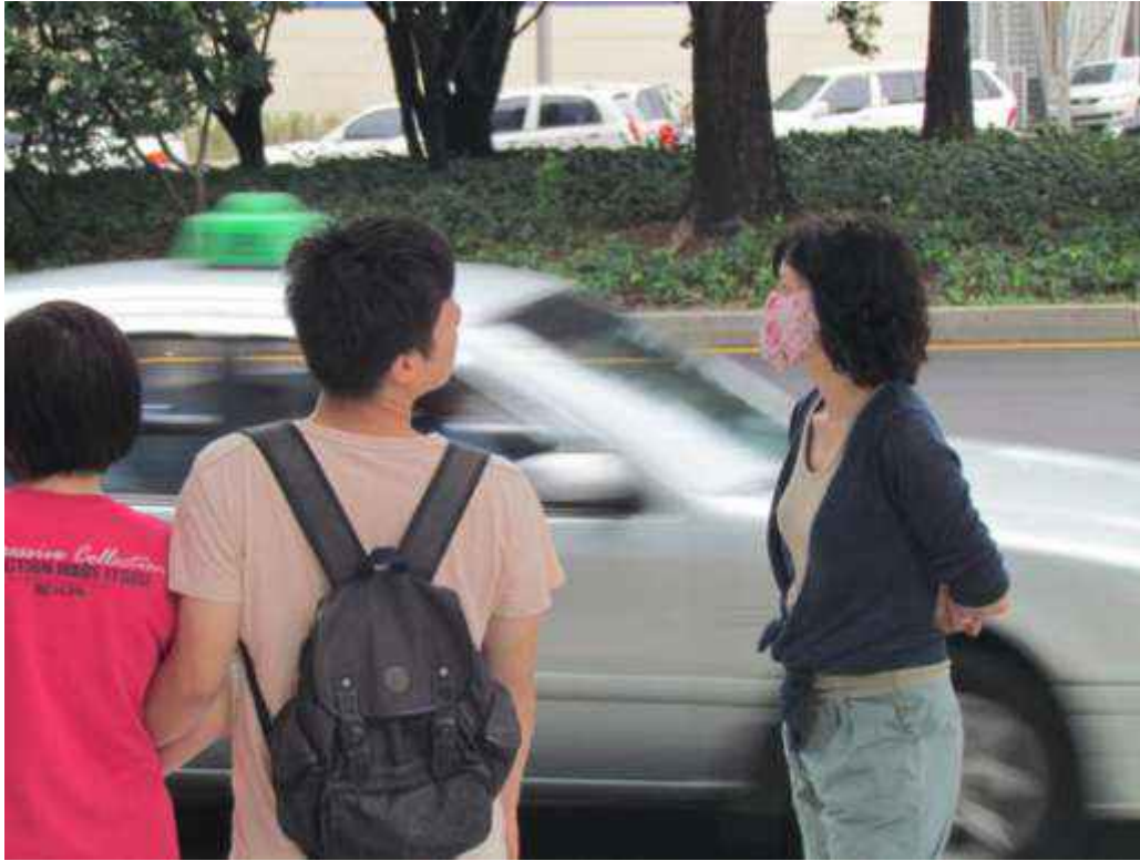
A Korean woman wears a face mask to protect herself from pollution