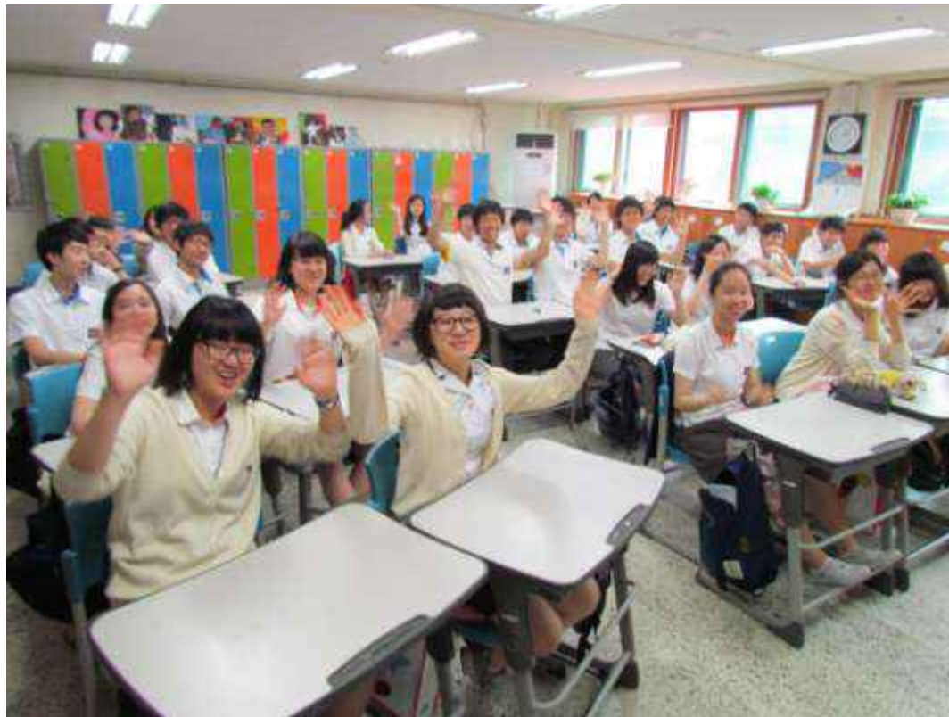
High school students in a private school in Seoul, South Korea