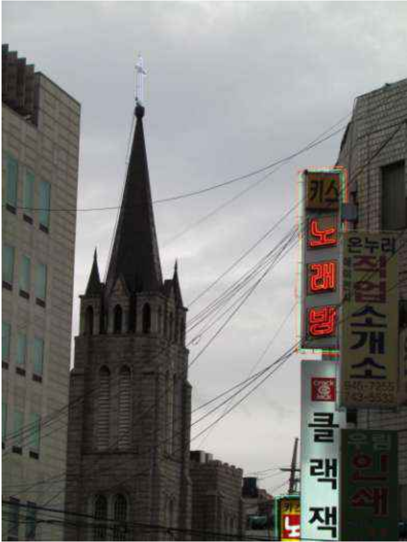
A Christian church in Seoul,