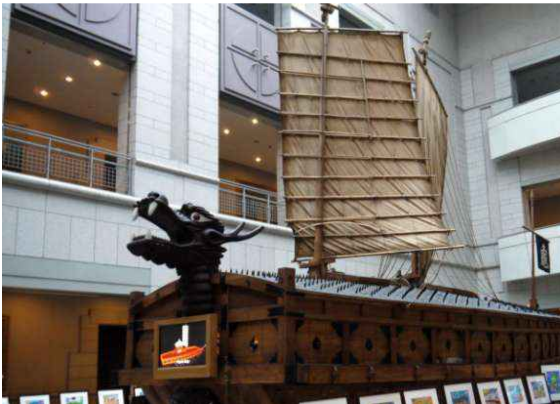
A turtle ship