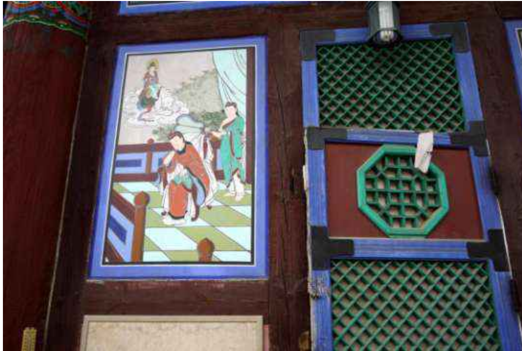
Paintings at a Buddhist temple in the southern part of the Korean Peninsula