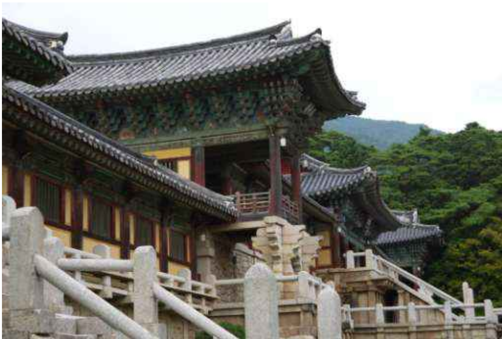
A Buddhist temple in the southern part of the Korean Peninsula