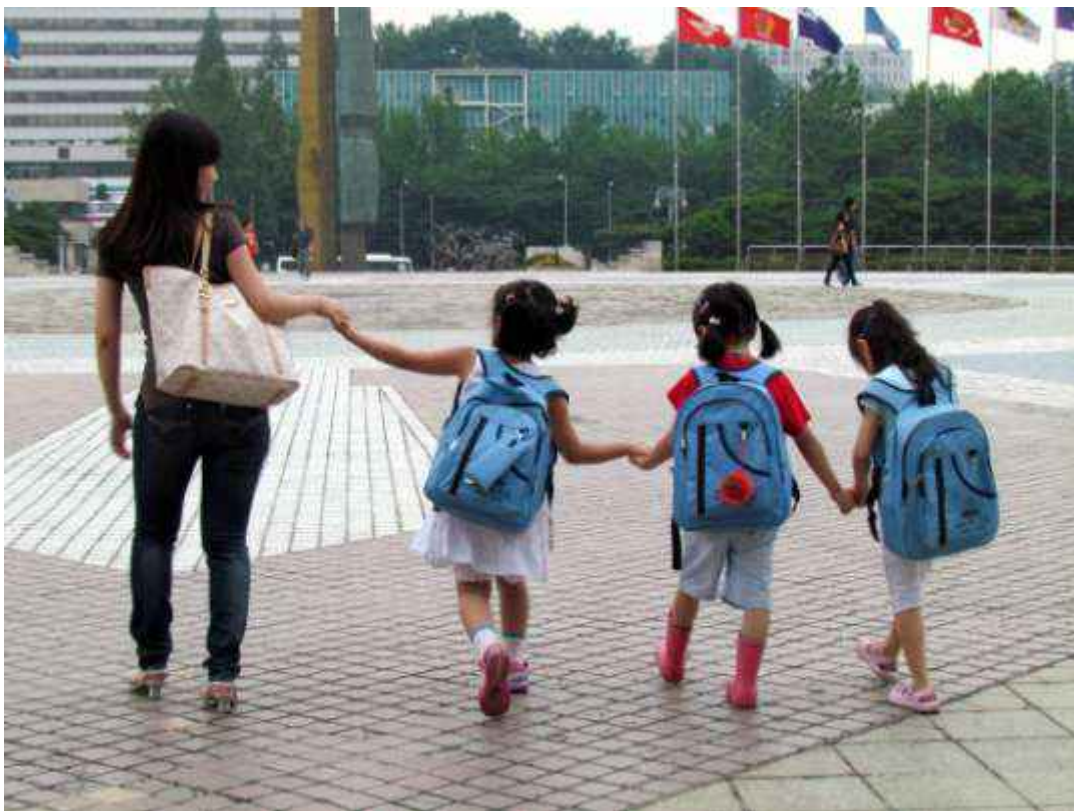
School children on a field trip in Seoul, South Korea