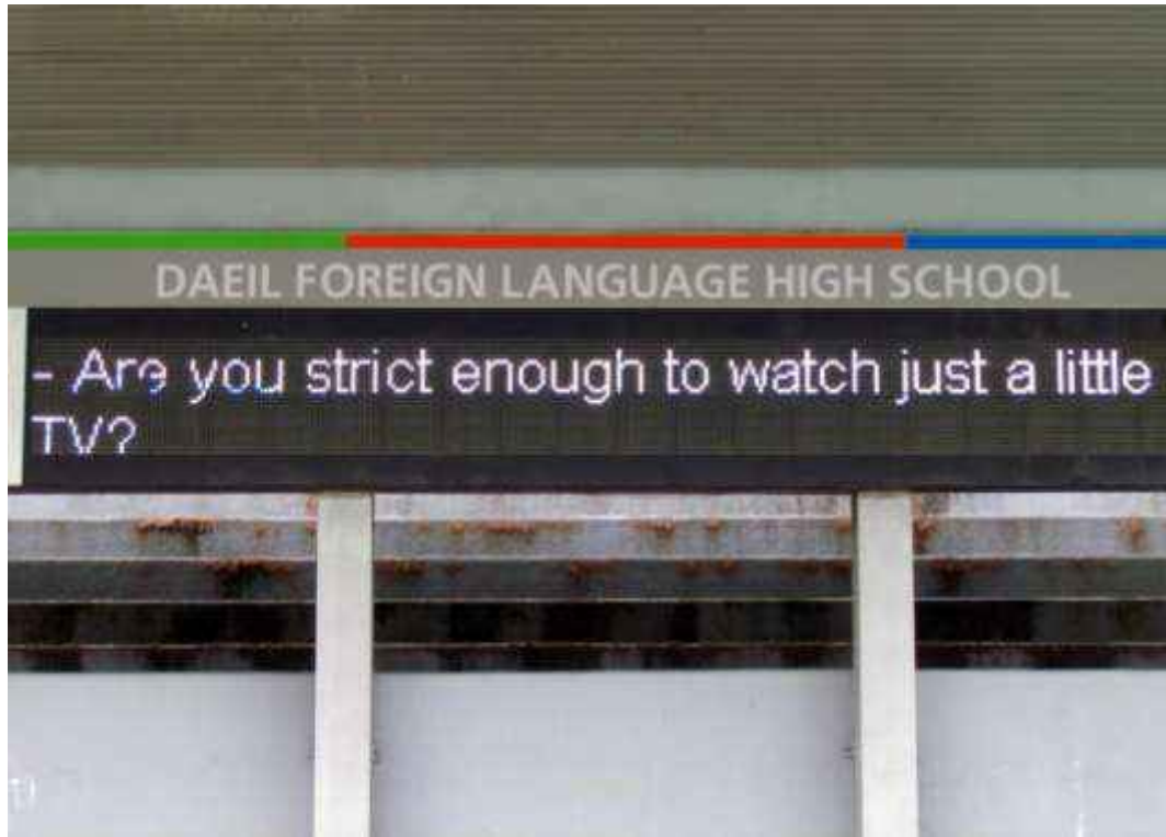
The sign outside of a high school in Seoul, South Korea