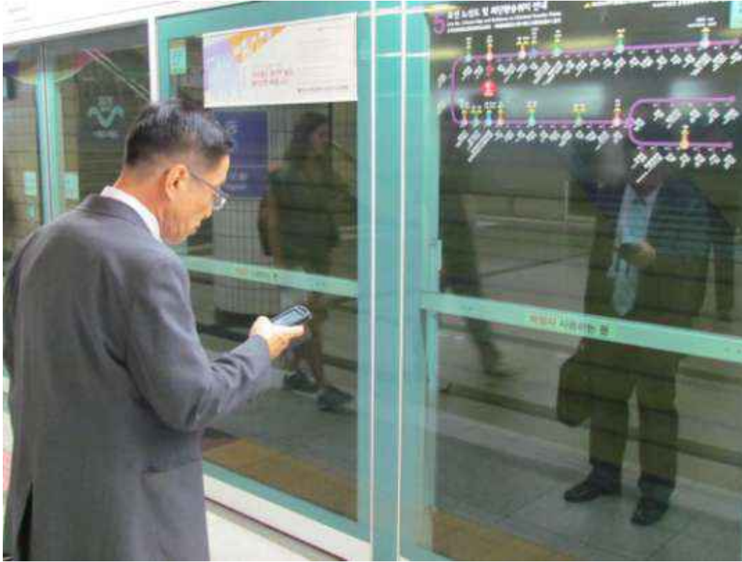
A Korean man uses his cell phone while waiting for a subway train in Seoul, South Korea