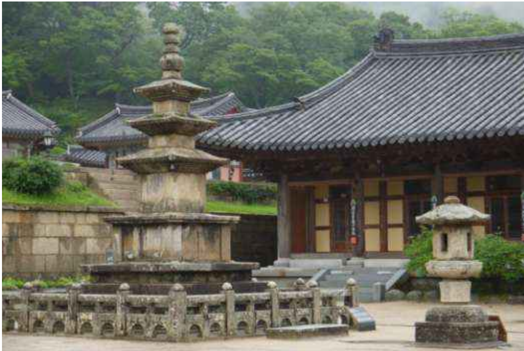
A Buddhist temple in the southern part of the Korean Peninsula