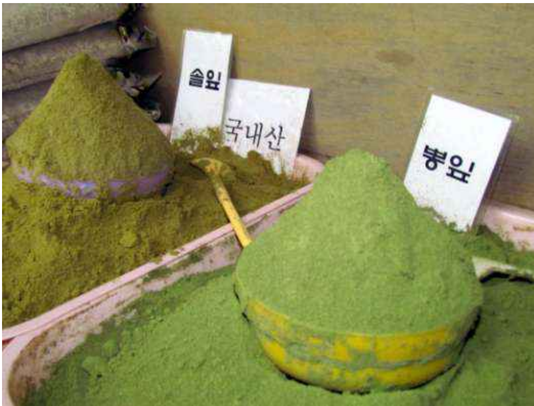
Spices for sale in Korea