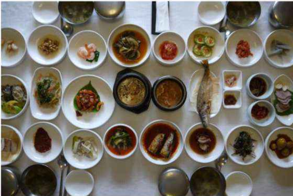
A Korean table setting