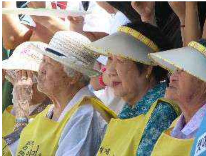
Some of these women have attended close to 1000 rallies.