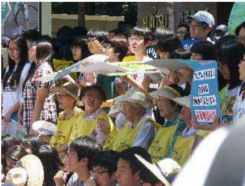
Supporters included high school students, college students, lay persons, and clergy.