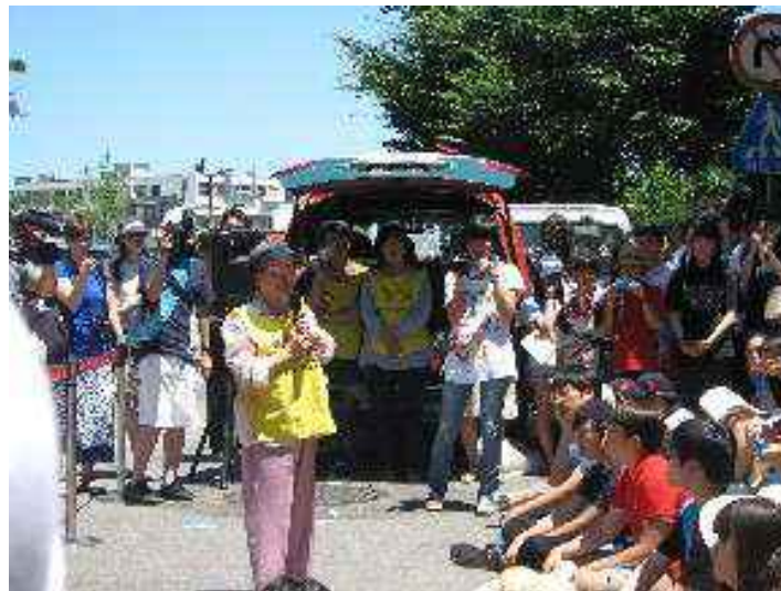
A survivor gives testimony of her experiences as a Comfort Woman.