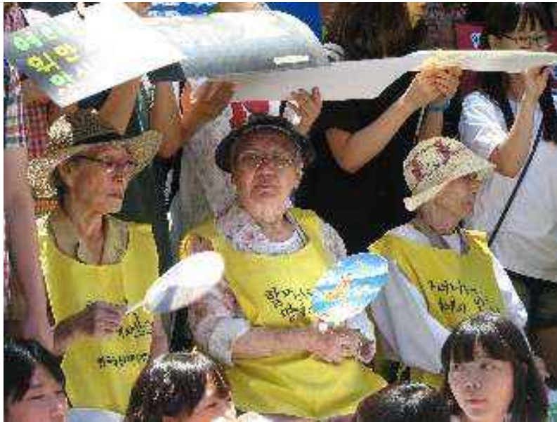
Comfort Women, referred to as “Halmoni” which means Grandmother.