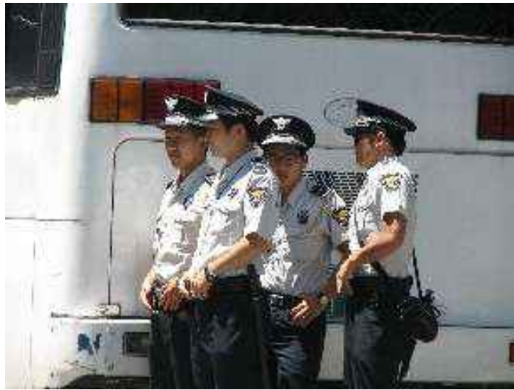
Korean soldiers observe from across the street at the Japanese Embassy.