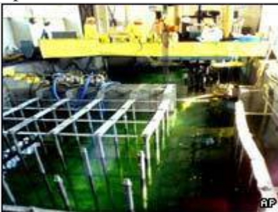
Nuclear ambitions: Fuel rods at the Yongbyon facility

2006 February - High-level talks with Japan, the first since 2003, fail to yield agreement on key issues, including the fate of Japanese citizens abducted by North Korea.