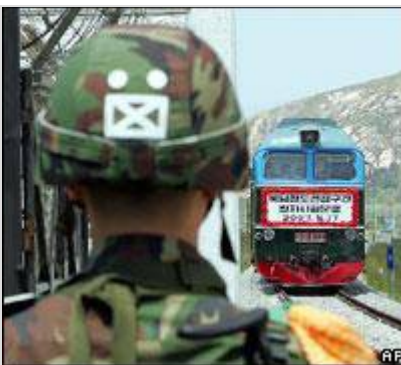
Trains from North and South crossed the border on a test run

Q&A: N Korea's nuclear threat In pictures: Yongbyon N Korea demolishes reactor tower