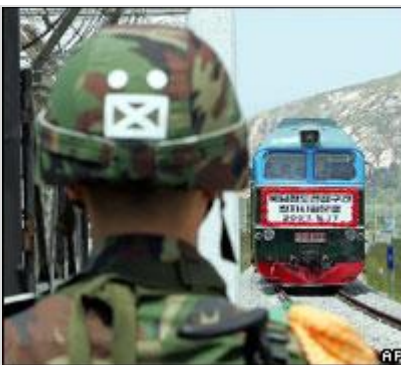
Trains from North and South crossed the border on a test run

Q&A: N Korea's nuclear threat In pictures: Yongbyon N Korea demolishes reactor tower