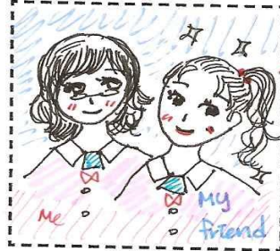
Caption: It's just a character.. ㅎㅎ

Draw or attach a picture of yourself here.